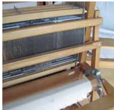
Detail of ratchet

Loom in excellent condition. Always kept in the house in a conditioned space.