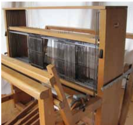
Extra heddles on eight harnesses